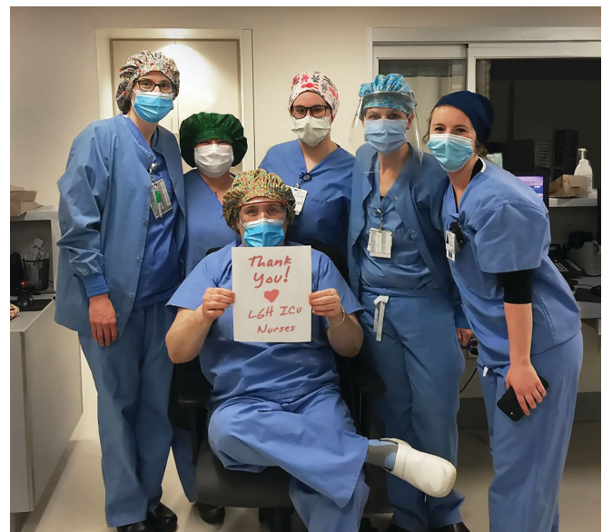
Members of Lowell General Hospital's hardworking frontline staff who were the recipients of the generosity of the Auxiliary. The Auxiliary is so pleased to support the dedicated clinicians and caregivers as they continue to fight the pandemic and keep our community safe and healthy.