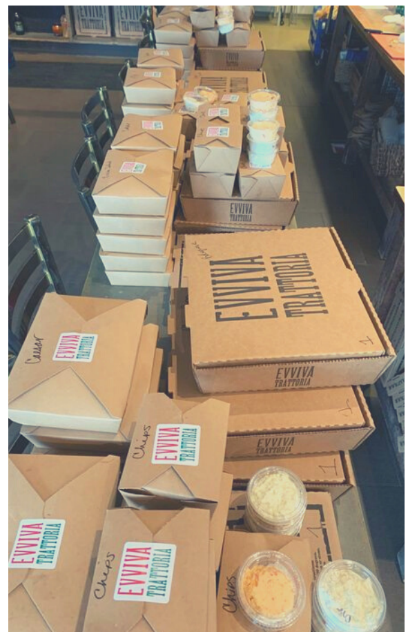
The delicious meals that Evviva Trattoria prepared for Lowell General Hospital staff, sponsored by the Auxiliary