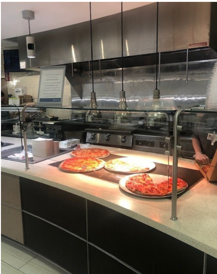
The Main Campus cafeteria set up for an all staff pizza party, courtesy of the Lowell General Hospital Auxiliary.