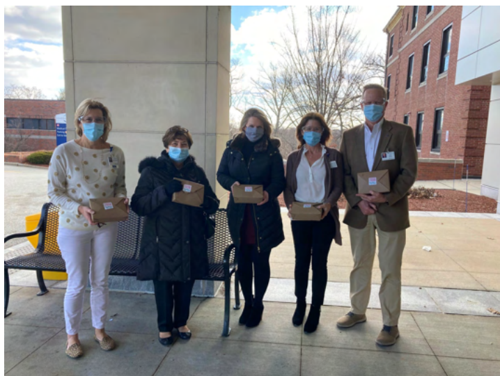
Evviva Trattoria delivered 157 box lunches to the Main Campus Operating Room and Drum Hill Surgical Center on December 29, 2020.