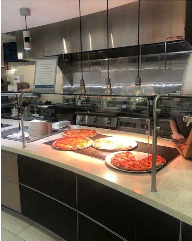
Brickhouse Pizza Chelmsford delivered pizza to the hospital every Friday during April 2020.

Despite the loss of income from our in-person events, the Auxiliary was able to continue with its mission of supporting the hospital by making food donations for hospital staff and volunteers who are doing the extraordinary work caring for the medical needs of our community during this pandemic.